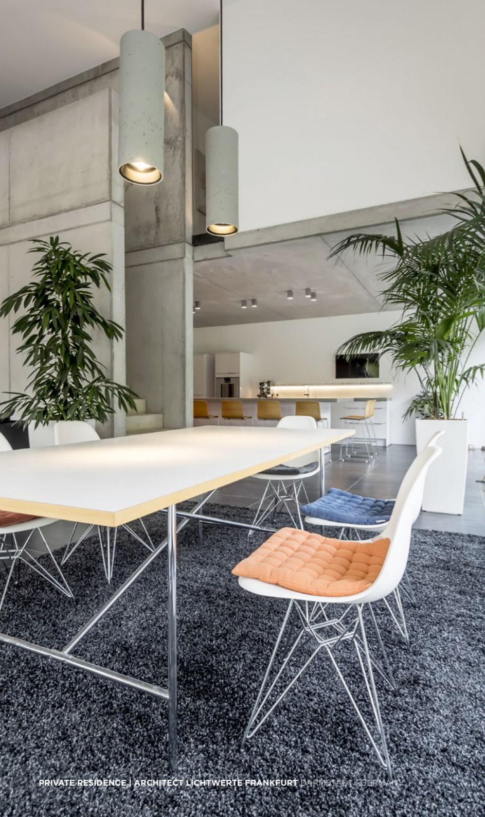
PRIVATE RESIDENCE | ARCHITECT LICHTWERTE FRANKFURT DARMSTADT | GERMANY